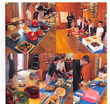
Bake Sale for Star Bereavement